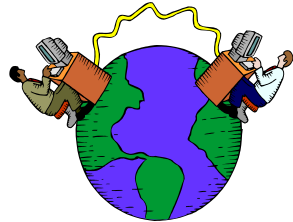
Communicate with family and friends the world over. Learn computer use for the home.

Get involved with the world—use a computer